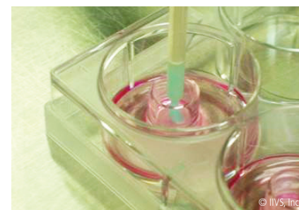
EpiOcular™ (MatTek Corp) Category I, III, or IV

While this strategy was developed for antimicrobial cleaning products, the agency will consider alternative tests on a case-by-case basis for other classes of pesticides and pesticide products, including conventional, biochemical, and other antimicrobial pesticides not within the scope of those with cleaning claims.