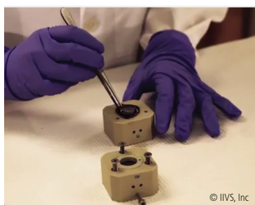
BCOP Assay Category I, II, or III